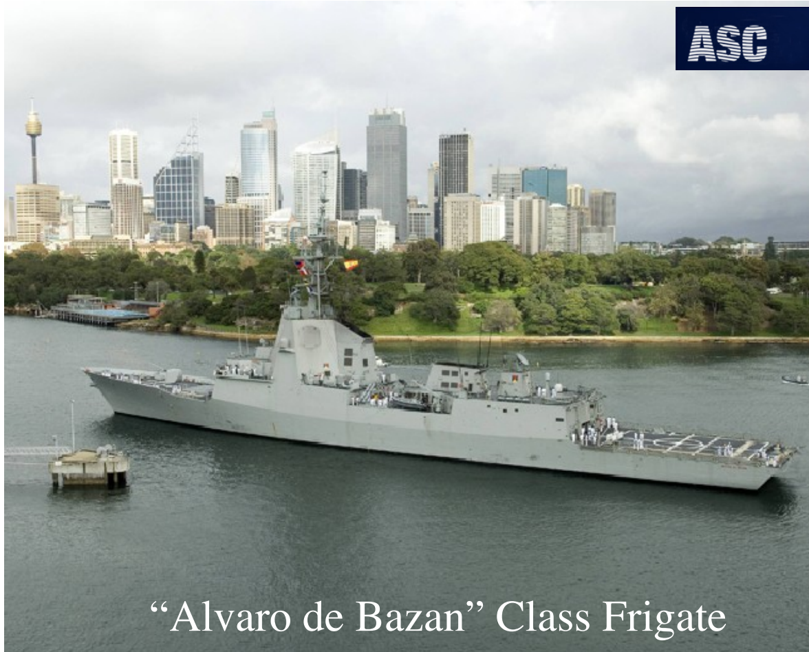
“Alvaro de Bazan” Class Frigate