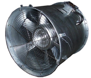
Engine Room Fans