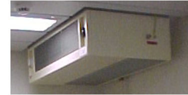
Fan-coil / Unit-coolers