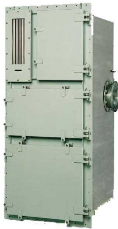
NBC-Filter unit 1200 m3/hr