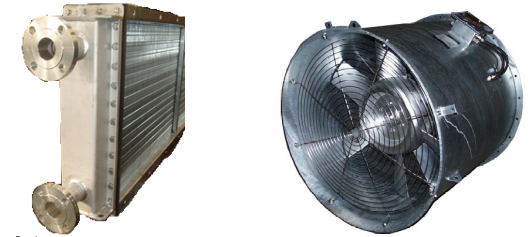
Engine Room Fans and Engine Room Coolers & Heaters