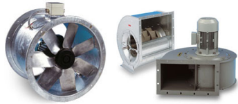
Mechanical Ventilation Fans and Vehicle Deck Fans