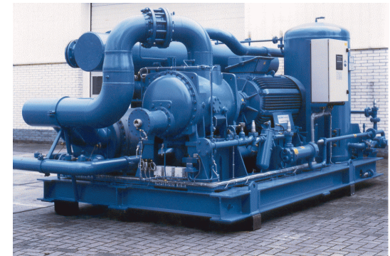
CWU 810 kW